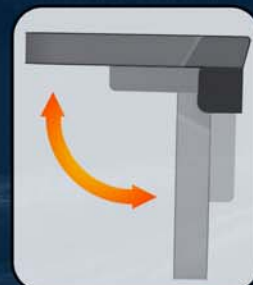
Folds down easily for stowage